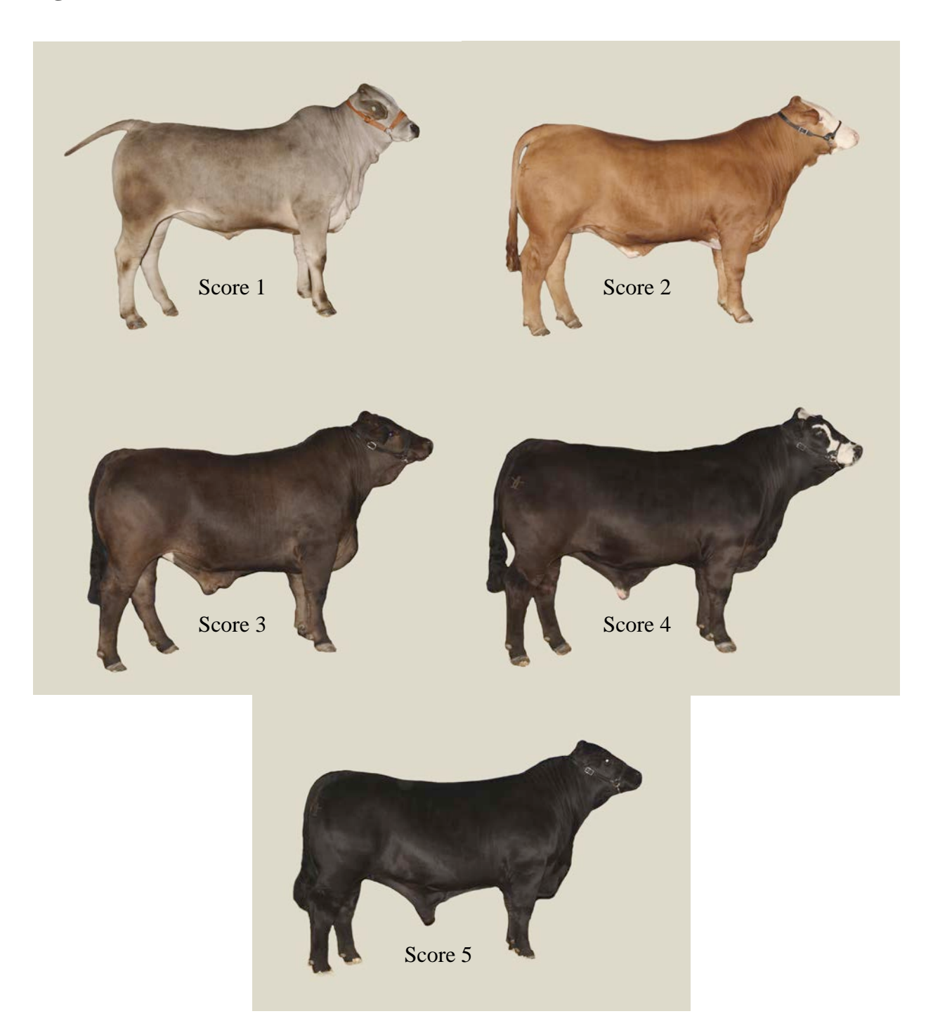
Figure 1. Sheath Scores