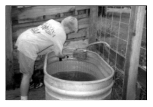
Consistent cleaning of livestock watering troughs is important for animal health.