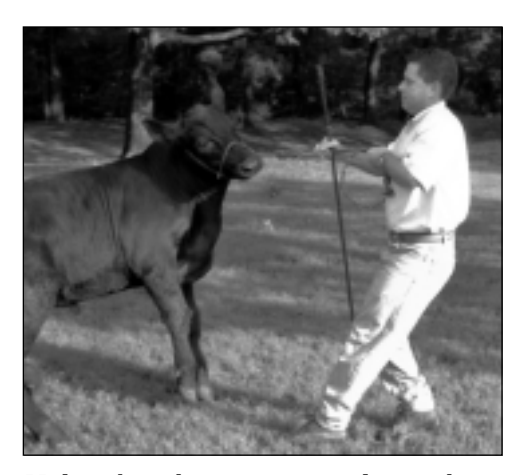
Halter breaking young calves takes consistent work.

Place the halter on the calf and adjust it to fit correctly. For proper fit, the nose piece should be up over the nose, just under the eyes. The halter should be moderately loose. Tightness can cause sores behind the ears.