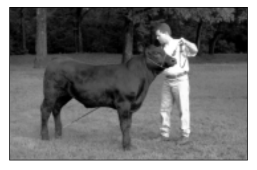
Young Exotic/European/Continental steer.