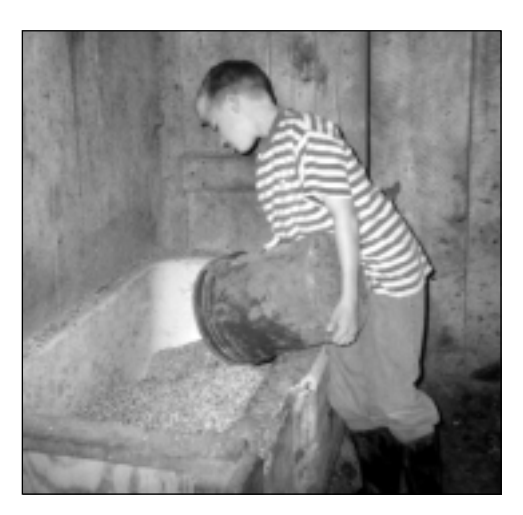
Putting out ration for group feeding.

determine the optimal amount of feed for each steer/animal is to observe its droppings.