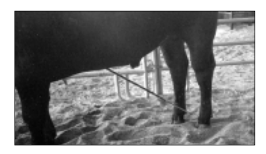
The rear feet should be set square to best show off the animal's rear quarter.