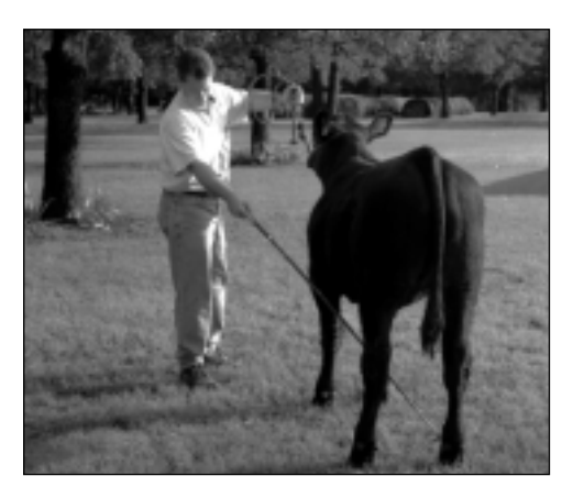
Teaching a young steer to set his feet square with a show stick.