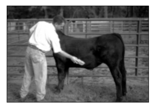
Daily brushing of calves is important.