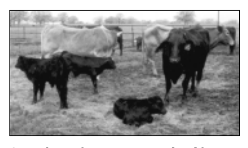
Cows kept for commercial calf production.

More information on commercial cattle projects can be obtained from your county Extension agent.