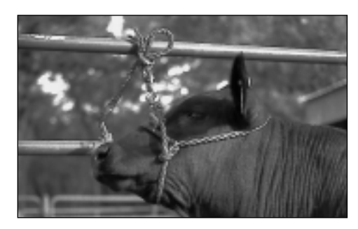
Calves should be tied daily.

The calf should rest until late afternoon. At this time, the owner should clean the stall and rinse and brush the animal again if possible. End the day with the evening feeding. Again, feed as the tempera-