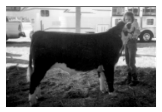
Prospect Hereford steer.